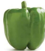
1-2 sweet peppers, depending on size