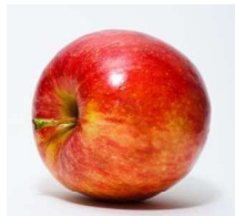
1-2 apples, depending on size