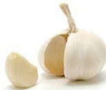
1-2 garlic bulbs, depending on size