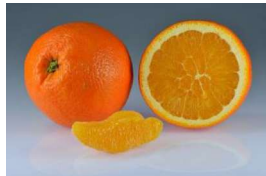
1-2 oranges, depending on size