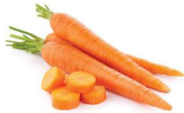
1-2 carrots, depending on size