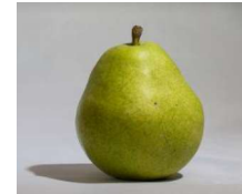
1-2 pears, depending on size