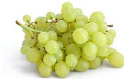
2 cups of grapes