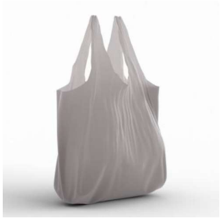
1 standard-sized grocery bag

Groups purchase and assemble 25 or more fruit bags. Please email suzanneldavenport@gmail.com to schedule a delivery or for more information.